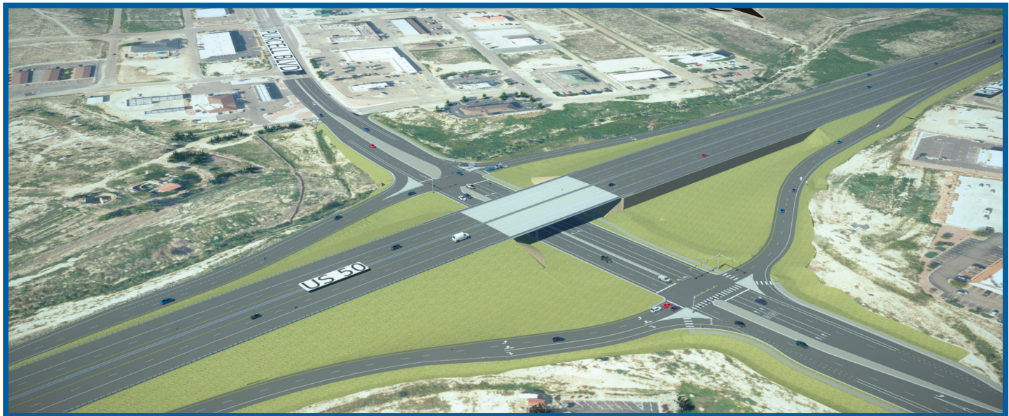
A rendering of the completed interchange